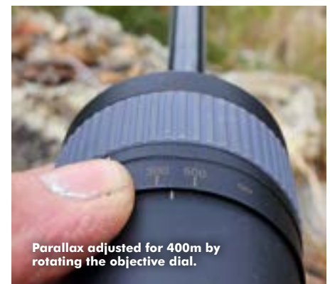
Parallax adjusted for 400m by rotating the objective dial.