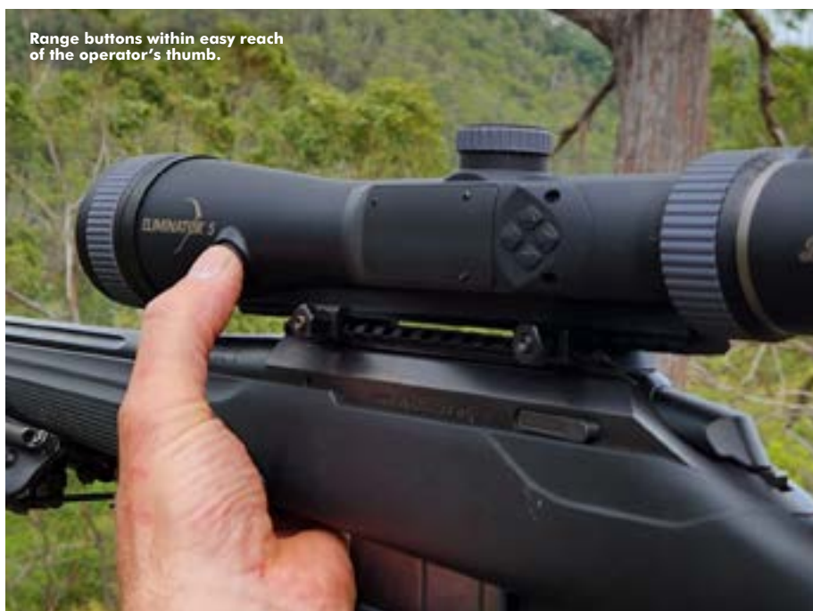
Range buttons within easy reach of the operator's thumb.

I must stress the X-96 aiming marks and display calculations are of more use at extended ranges which, after all, is the purpose of Eliminator 5. Quite simply, once programmed your scope should enable you to hit targets at long range and I was keen to test that accuracy.