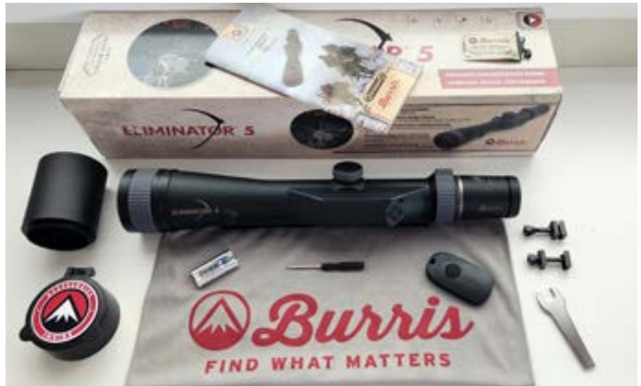
Eliminator 5 and its inclusions, note the sunshade (left) and remote pad (right).

The same applies to factory ammunition and ballistic information is printed on most modern ammo packets. Alternatively, Burris has hundreds of factory ammo listings with their relevant data which, once selected, automatically upload to the calculator. After keying my info into